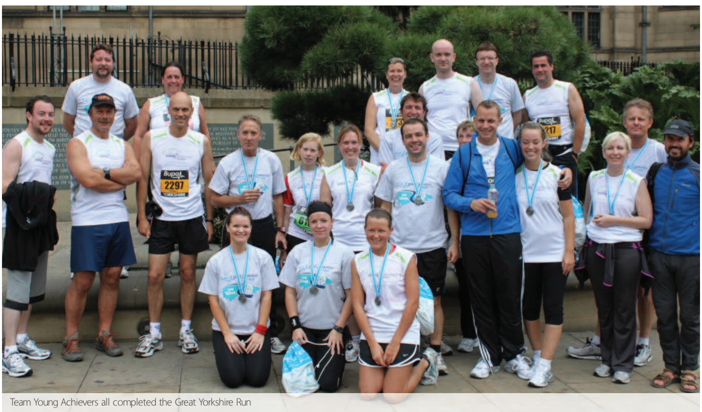
Team Young Achievers all completed the Great Yorkshire Run