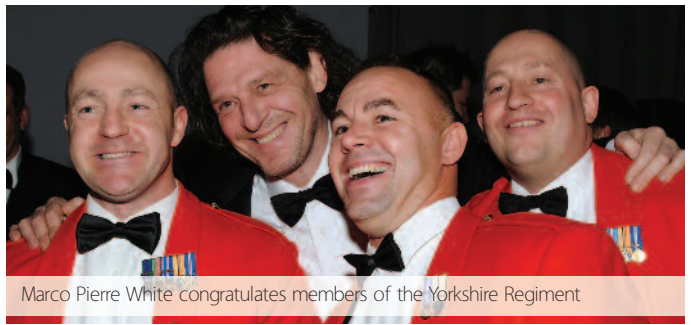
Marco Pierre White congratulates members of the Yorkshire Regiment

The Judges said: "While individual acts of bravery have been recognised, we felt that the regiment as a whole deserved recognition too."