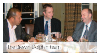
The Brewin Dolphin team