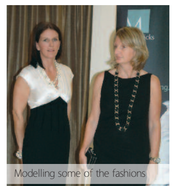
Modelling some of the fashions