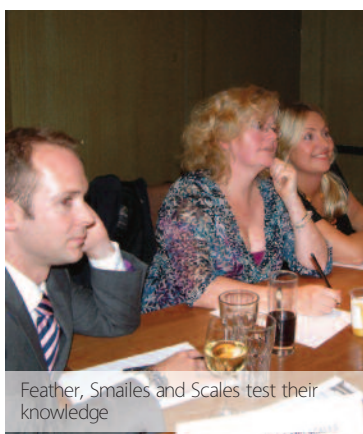
Feather, Smiles and Scales test their knowledge